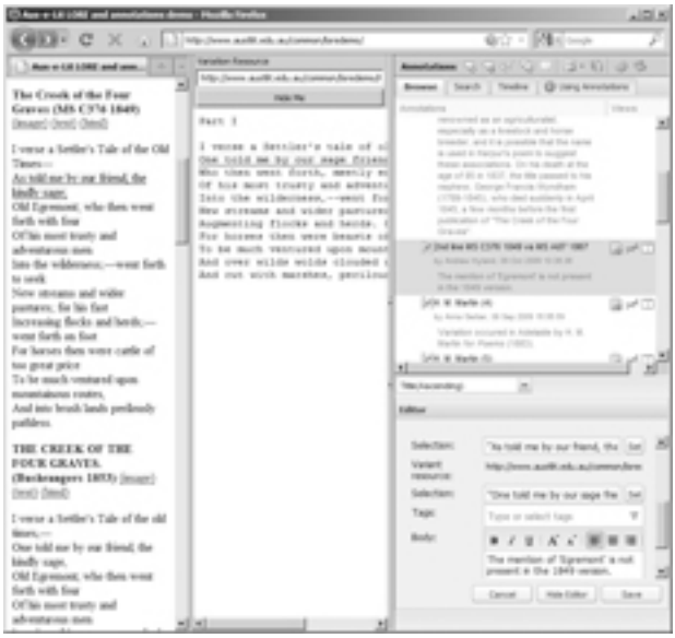
Fig. 2. Annotating the differences between two scholarly editions in AustLit

For example, Figure 2 illustrates a scholarly annotation example involving multiple targets, in which a scholar is making a comment on the differences between segments in scholarly editions of the poem "The Creek of the Four Graves" by Charles Harpur.