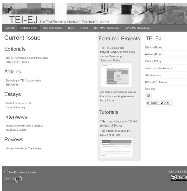
Fig. 2. Screenshot of TEI-EJ website

This paper will introduce the TEI-EJ project, describing the why and how of the key theoretical, technological and editorial decisions that drove development as we advanced from theory into practice. In doing so, it aims to establish the project as a new model for academic publishing which is designed to harness emerging technologies, to leverage the fact that “Open access is changing the public and scholarly presence of the research article” (Willinsky), to promote learning objectives beside dissemination of scholarship, and to elevate the role of reader/end-user to the position of chief stakeholder.